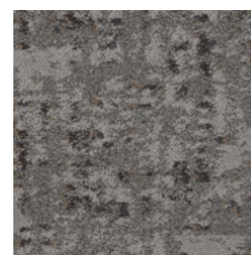
Agave 21535 LRV 17.5