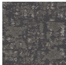
Immerse 21555 LRV 9.2