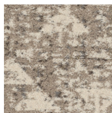
Maiz 21111 LRV 34.9