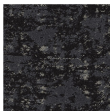
Mole 21505 LRV 3.9