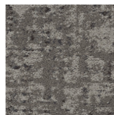
Tejate 21518 LRV 18.6