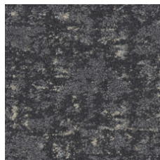
Retreat 21580 LRV 9.1