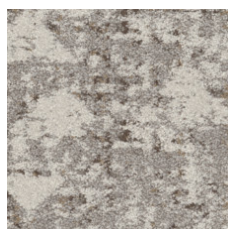
Native 21105 LRV 33.7